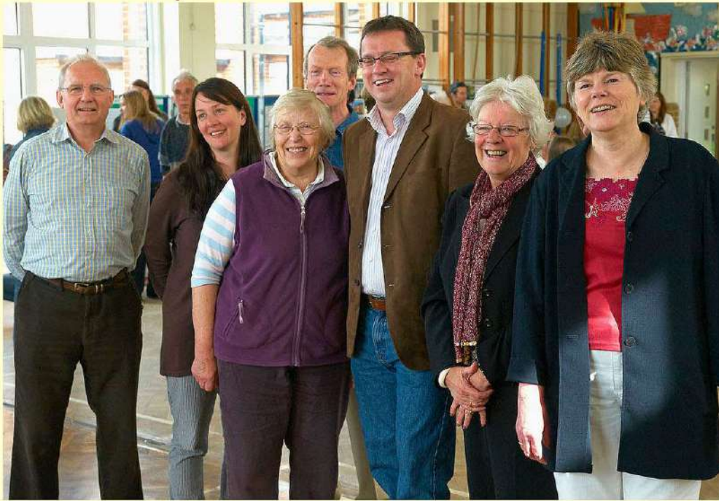
The EGRA committee with local MP Rob Wilson (centre)