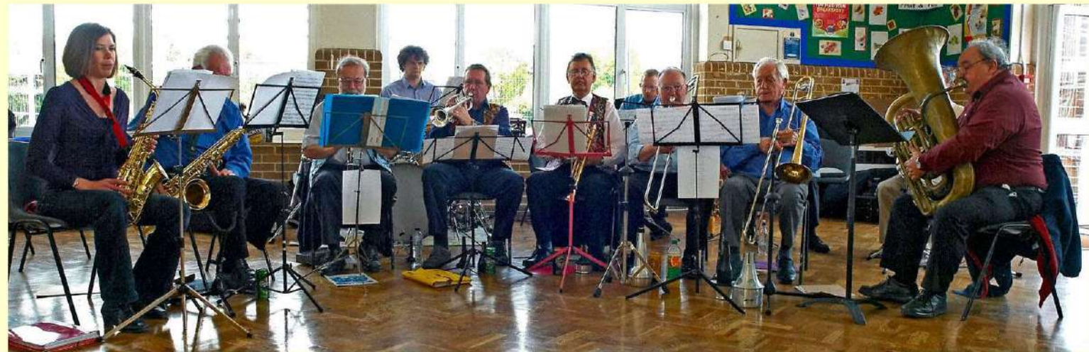
During the afternoon, we were entertained by the Earley Centre Jazz Band, who gave rousing sessions of familiar tunes, mainly trad. and blues.