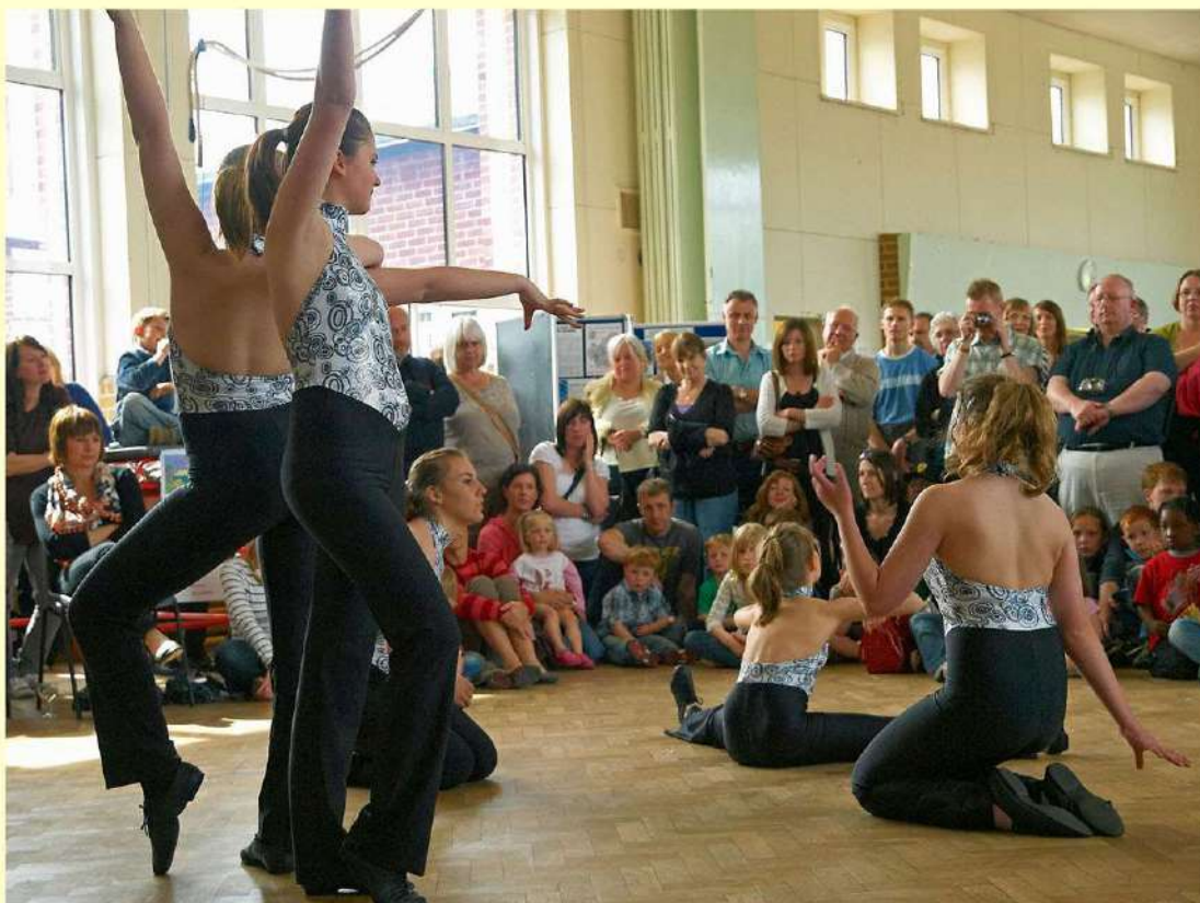
Senior Street Jazz Troupe dance to 'Womaniser'