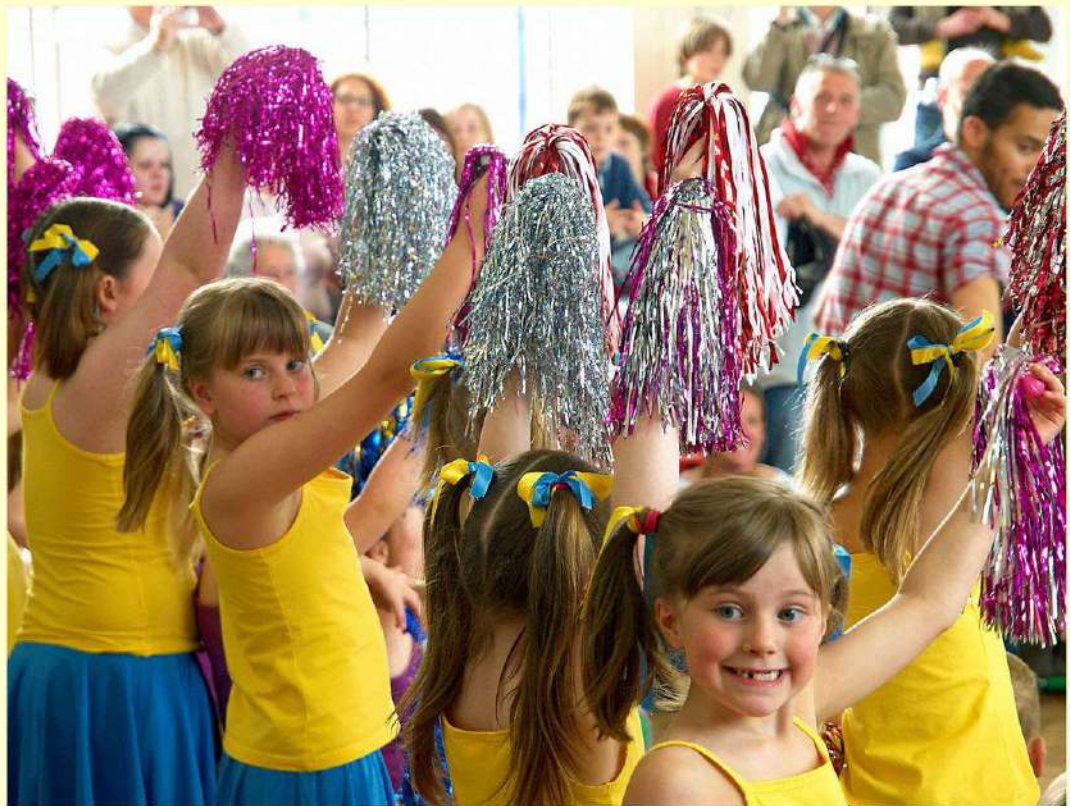
Kids Street Jazz pupils perform High School Musical