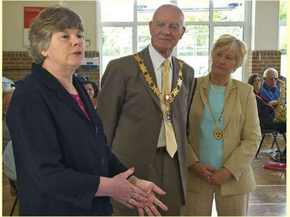
The Mayor and Mayoress arrive