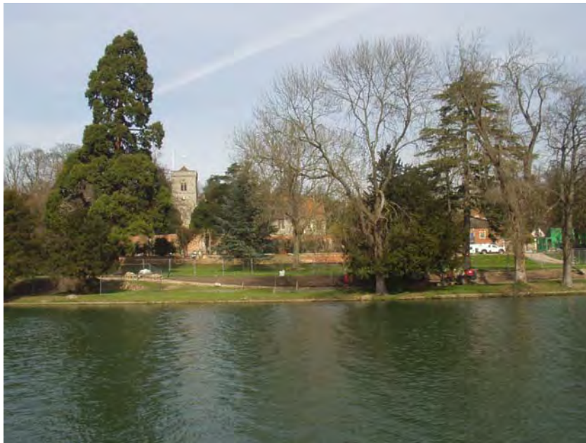
Caversham Court with St Peters Church in the background

Adjoining the River Thames and at its eastern end, the conservation area is generally flat but the land rises to the north and west, such that St Peters Church occupies a fairly prominent position at the eastern end of the Warren escarpment, which extends westwards along the full length of The Warren. The escarpment represents a foothill of the Chiltern Hills, an Area of Outstanding Natural Beauty, which extends into South Oxfordshire. St Peters Church therefore represents a significant landmark building when seen from the south (from the River Thames itself and the south bank) and from the east along Church Road and from the bottom of St Peters Hill.