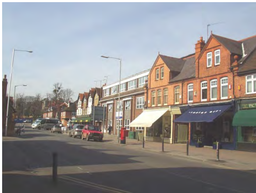
North side of Church Road looking west

The properties on the north side of Church Road/St Peters Hill have been subject to some redevelopment. Redevelopment within the conservation area has however respected and preserved the character and appearance of the conservation area by the use of compatible building scales and materials, and the retention of important linking features such as boundary walls and tree cover. In this way, the spacious, verdant feel of the area has been maintained.