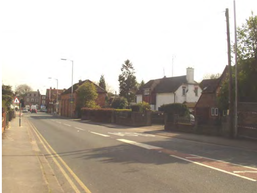
South side of Church Road looking east