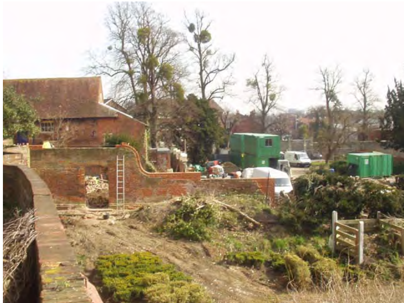
Works in progress at Caversham Court

Caversham Court once housed the Rectory to St Peters Church. The original Rectory was built in the C17 and remains of the house and grounds, inter alia, include: (1) the Garden Pavilion/Gazebo, (2) the stable block and (3) the yew hedge along the raised east-west walkway. A later rectory was built on the site of the original rectory in the C19 and incorporated some of the original features but this was demolished in 1933. Part of the restoration works currently being undertaken at Caversham court is intended to expose the foundations of the original buildings and to provide interpretative material to explain the history and development of the site.