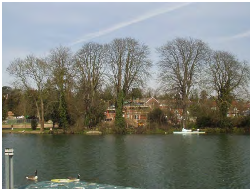
Trees at the Rectory (20) Church Road

Trees therefore make a significant contribution to the conservation area’s special character and sense of identity. Significant tree groups are shown on the Appraisal Map at Appendix 1.