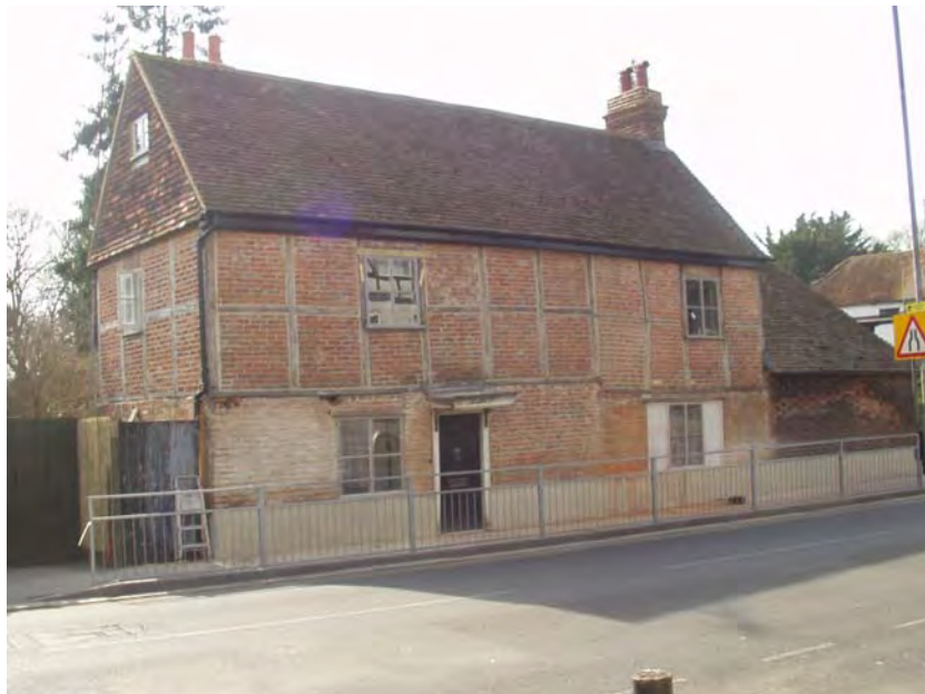
16 Church Road

Apart from 47 Church Road which dates from the late C19, all the other buildings in the area are inter war or later, but those on the south side of Church Road display an architectural style and materials which generally maintain the original character of the area. Properties on the north side and within the conservation area, although