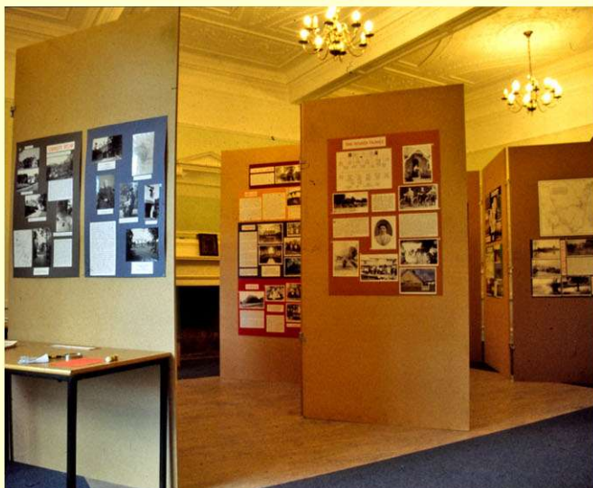
Exhibits inside the mansion - the original Caversham Grove house

The display boards are held by the History Department at Highdown School and used for educational purposes.