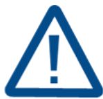
How to sign up to flood warnings and prepare for flooding