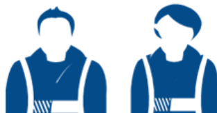
Members of the project team talked people through design options and answered questions

All the information that we shared is available on our website: