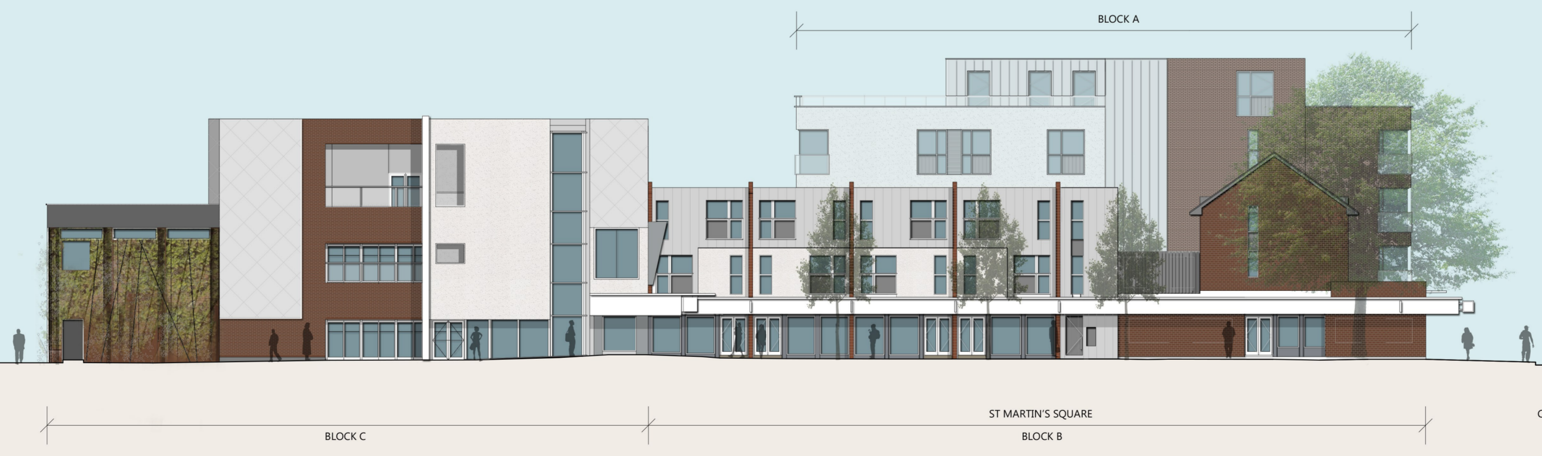
2 SECTION G-G (WEST) St Martin's Centre, Caversham 1:200