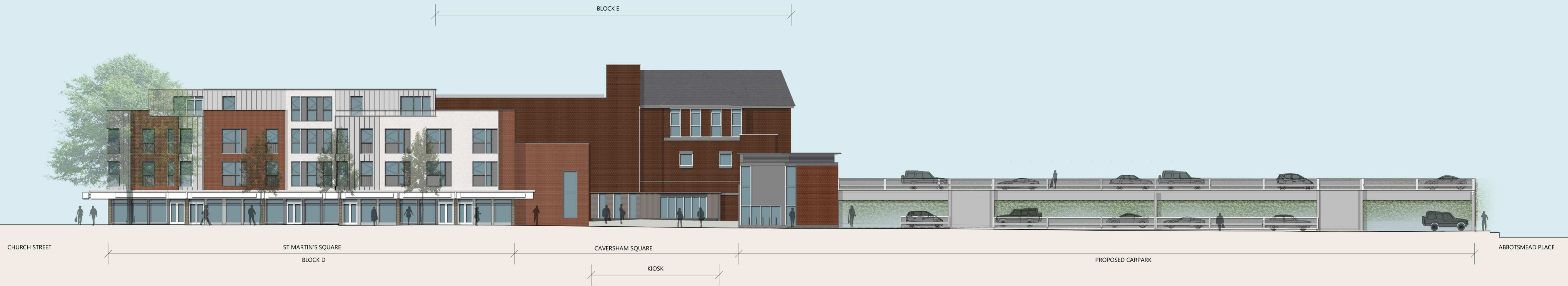
1 SECTION H-H (EAST) St Martin's Centre, Caversham 1:200