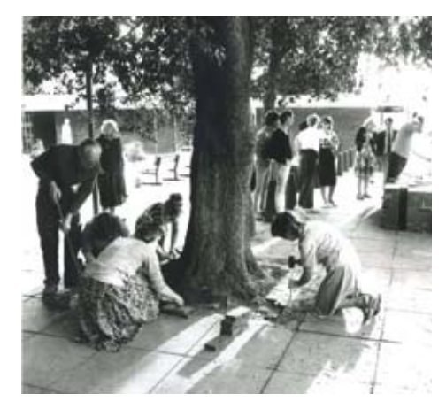
Protecting trees in the precinct

Across the nation it was feared that the arrival of large chain stores would result in the closure of independent and family businesses and Caversham feared it might lose its village identity. It was in this period of change that a residents' group was formed and subsequently formalised as an association.