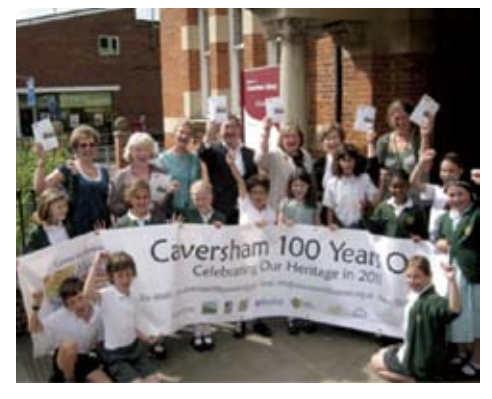
The launch of Caversham 100 Years On

The need for housing became acute in this decade. As South Oxfordshire has considered areas to site new housing, the border with