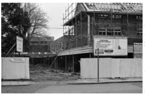
Construction of St Martin's precinct

Caversham House in Church Street was pulled down and construction started of St Martin's precinct.