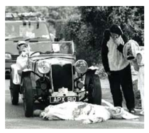
Protestors highlight the environmental consequences of the Bugs Bottom development

Infill development increased across Caversham and local associations came together to press for accompanying improvements in infrastructure, amenities and services.